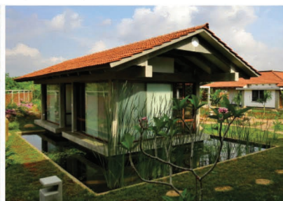
Temple Tree Retreat, Auroville