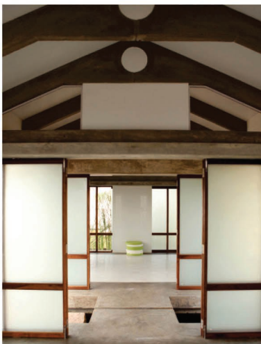
Temple Tree , Auroville