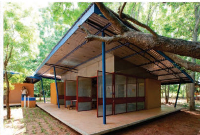
Deepanam School, Auroville