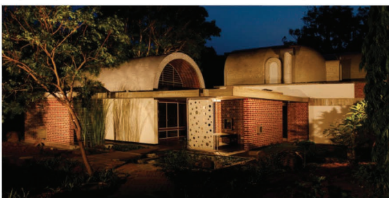
Studio Naqshbandi, Auroville