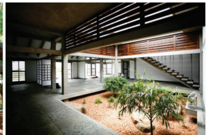
Reddy House, Kovalam ECR