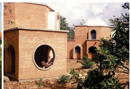
Yantra , Auroville